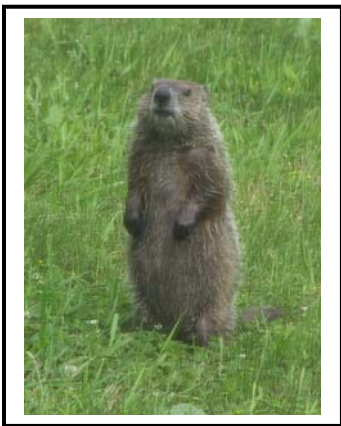
Early Spring...yeah right!