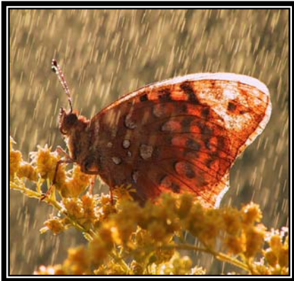
Spring is just around the corner...

Ordered by length of membership – longest to shortest in years. Future publications of this newsletter will list new members only.