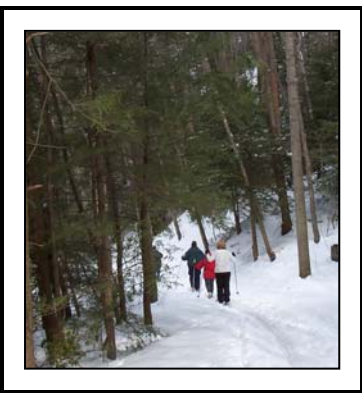
Cross Country Skiing on the Cowanshannock Trail

We also have a nice selection of Armstrong County apparel, souvenirs, maps and books!